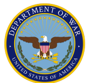
Department of War